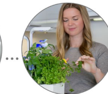
Harvest after 3 weeks